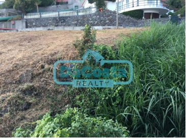
1511 Land Area (m²)